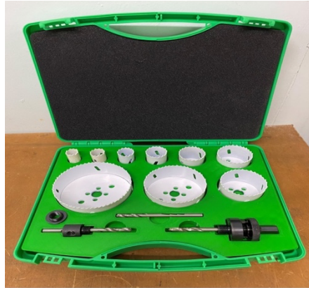
HOLESAW SETS - 8% COBALT